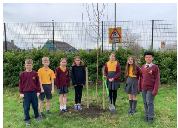
Year 6 School Councillors planted a Field Maple