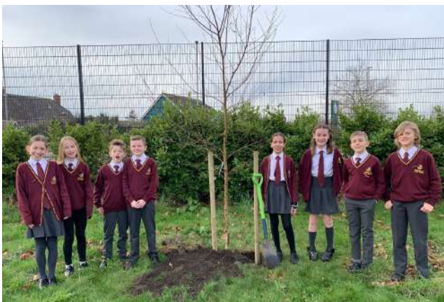
Year 5 School Councillors planted a Silver Birch