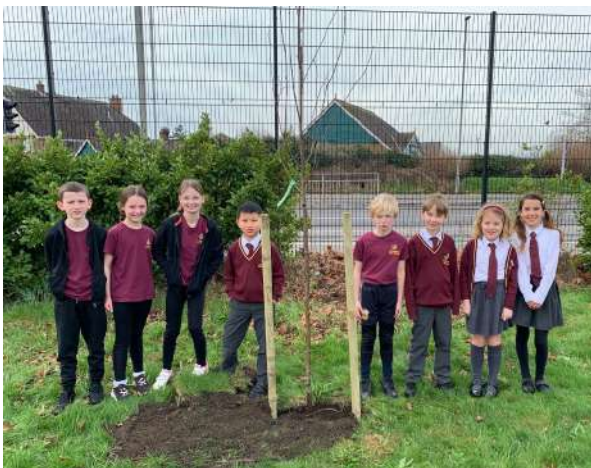
Year 3 School Councillors planted a Rowan Tree