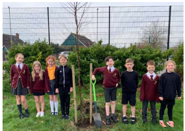
Year 4 School Councillors planted a Small Leaved Lime