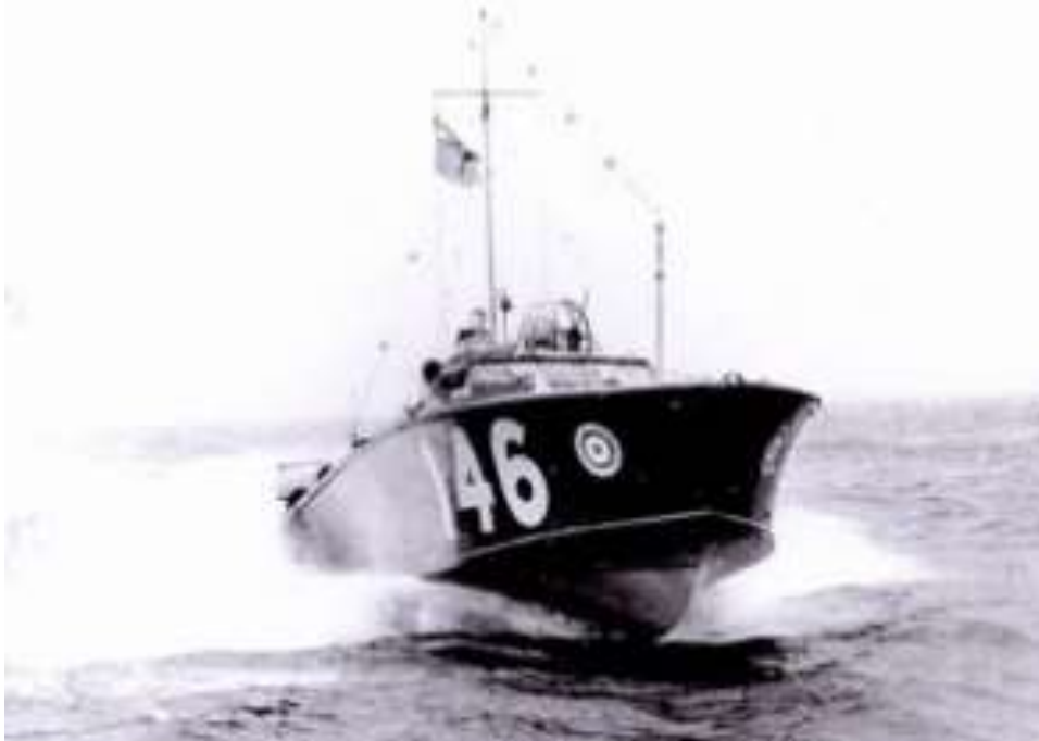
High Speed Launch seaplane off Calshot Spit