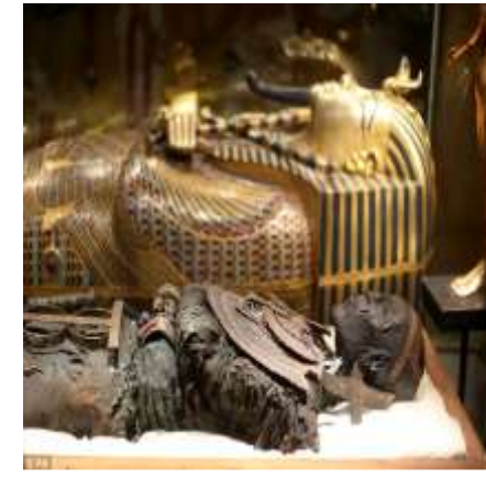
Tutankhamun's mummy was found inside the golden sarcophagus. His death mask is inlaid with deep-blue glass and precious stones.